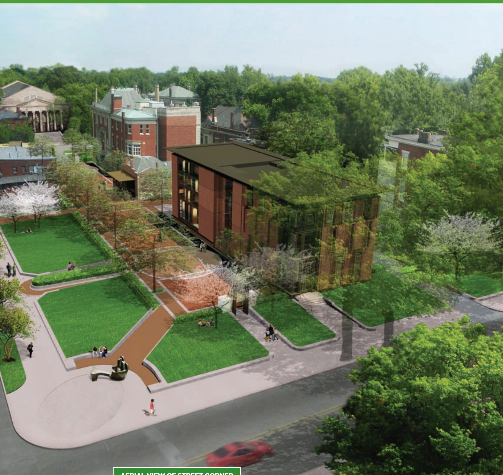
AERIAL VIEW OF STREET CORNER