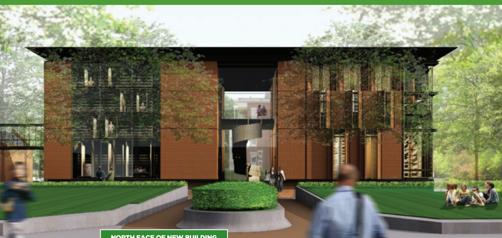
NORTH FACE OF NEW BUILDING