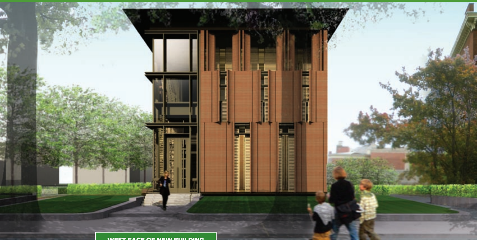
WEST FACE OF NEW BUILDING