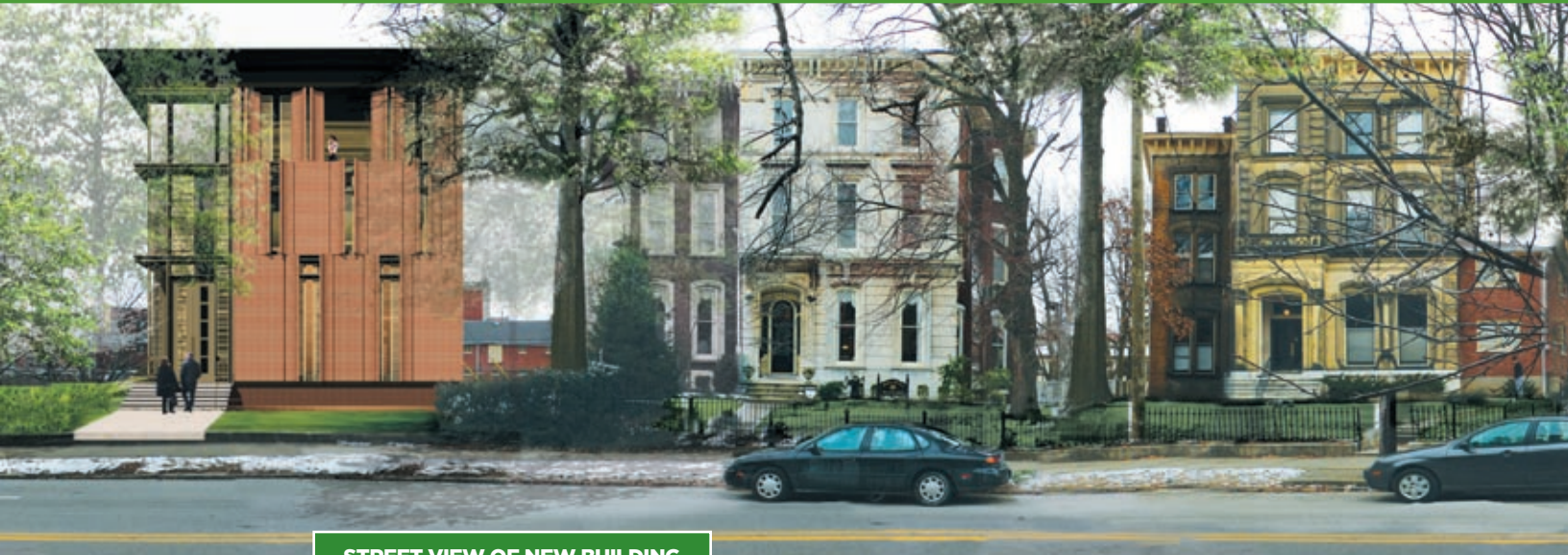
STREET VIEW OF NEW BUILDING